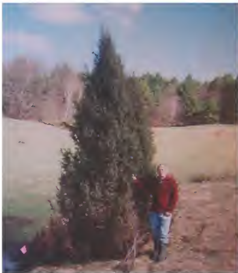
Fig. 9. var. depressa tree, Hartland, VT

It is interesting that the three trees from WV all contain an indel (CTTCT) not found in any other varieties (Table 1). It seems likely that these trees arose from seed of a single parent (or group of siblings) that also have the indel. The J. c. var. communis trees at Lower Glady and Helvetia, WV appear to have originated from seed dispersed by birds (Adams and Thornburg, 2010) from var. communis cultivated at nearby homes and cemeteries (Fig. 12). Columnar trees such as Cupressus sempervirens , Juniperus chinensis (strict cultivars) and J. c. var. communis (strict trees) are popular plantings in cemeteries in the US.